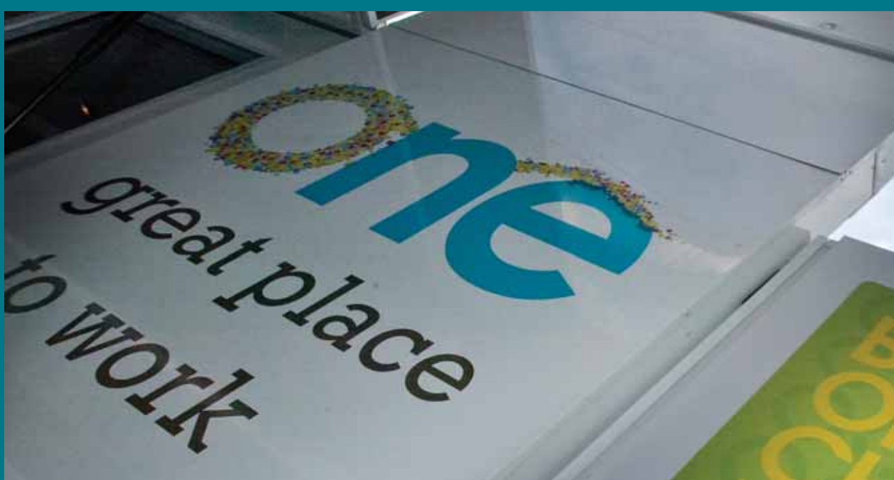
Work Highcross, Leicester, mobile roadshow

Hammerson has a proven track record in delivering employment opportunities for local people. At Bullring, Birmingham over 2,000 local people were placed into jobs and 76% of those were previously unemployed. Hammerson will develop a dedicated recruitment and training strategy for Watermark WestQuay working with public sector agencies, community and voluntary organisations to deliver recruitment and training initiatives for contractors, tenants and local communities.