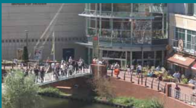
The Oracle, Reading

Hammerson has a well-earned reputation for delivering landmark schemes which provide attractive and efficient environments for local communities, occupiers, and customers and has a strong track record of successful partnerships with the public sector, landowners, joint developers and investors.