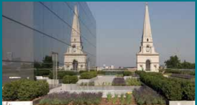
Bishops Square, London