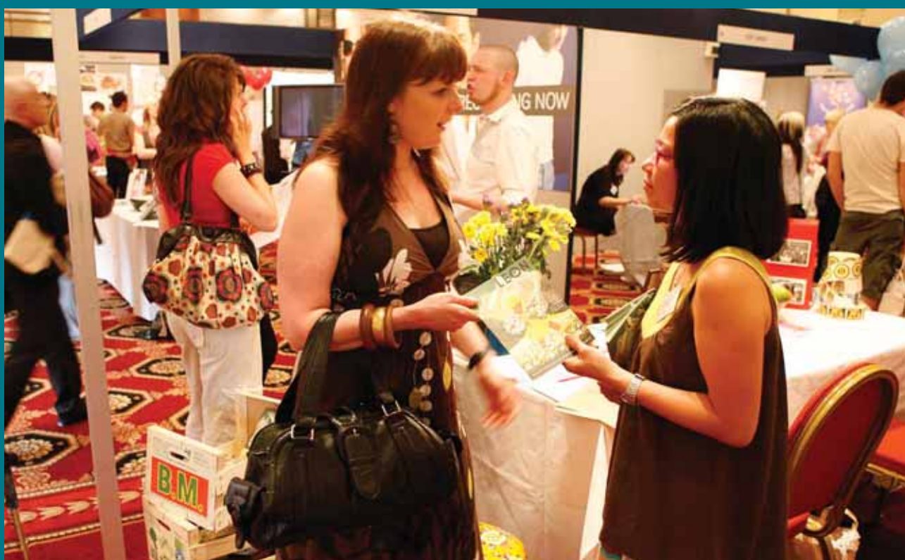
Cabot Circus, Bristol, jobs fair

Watermark WestQuay will help reinvigorate the southern area of central Southampton and will create over 1,000 new jobs for the city.